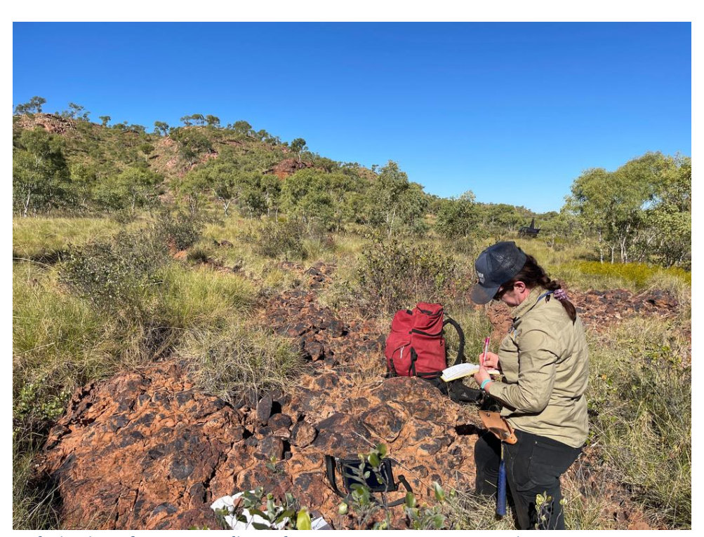
\textit{Figure 3. Resolution geologist pictured outcrop sampling at the \textit{Carrara Range Manganese Project August 2023}

The Carrara Range Manganese Project covers 1,271km<sup>2</sup> of terrain highly prospective for sediment-hosted battery metals and iron-ore. The area is underexplored, and only recently, in 2020, Geoscience Australia geologists identified a promising high-grade manganese mineral occurrence at surface (49.8% MnO) within Resolution's tenure. (Carson et al, 2020).