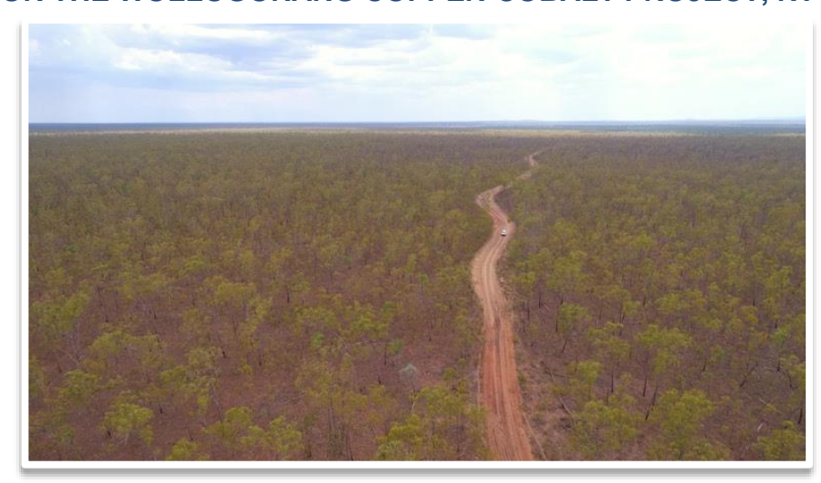
Figure 1. The Wollogorang Copper-Cobalt Project