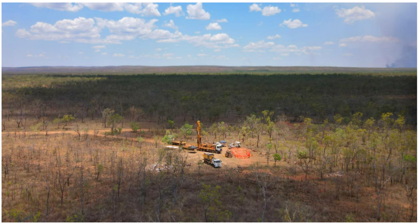
Drill rig set up over the first hole of the 2022 Wollogorang program

Resolution Minerals Ltd (RML or Company ) (ASX: RML ) is pleased to announce that the Company has commenced a planned 6,500m reverse circulation ("RC") drilling program at the Wollogorang Project in the Northern Territory. The project is highly prospective for sediment-hosted copper, cobalt and other base metals and is a key project in RML's search for new energy metals.