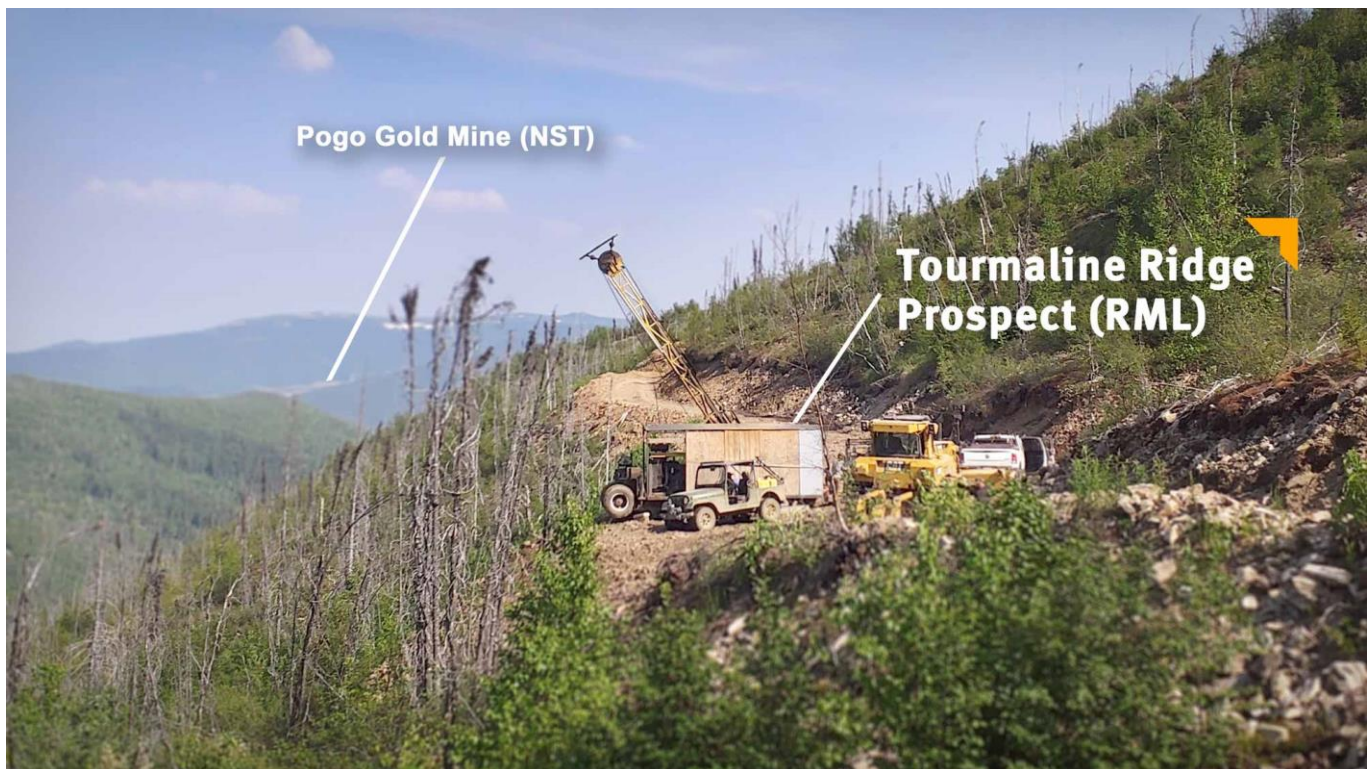
Figure 1. Drill rig at first Tourmaline Ridge drill site.