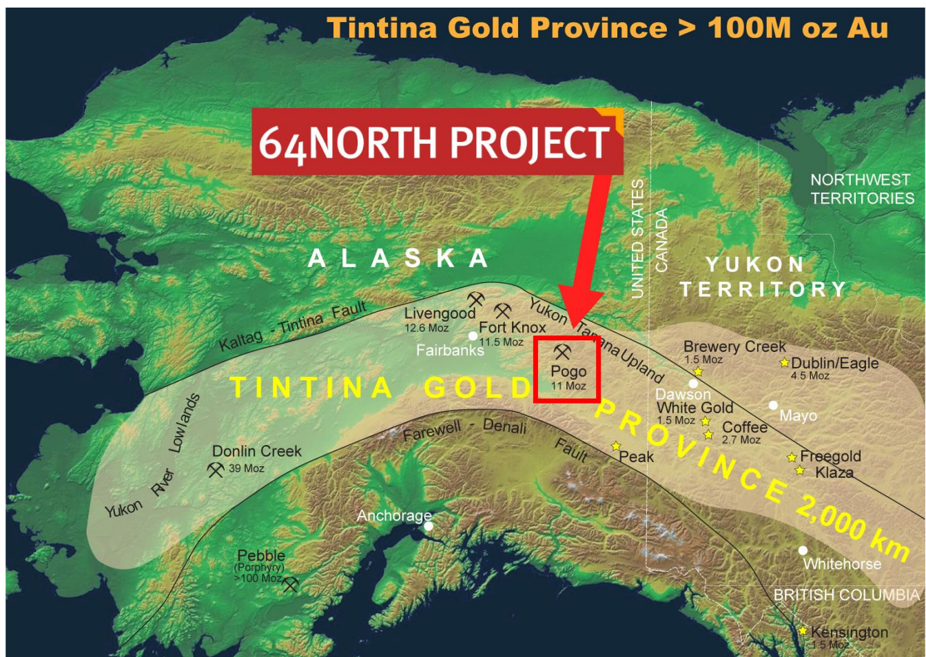
Figure 3 Deposit sizes stated as Endowment (Resources & Reserves + Historic Production) *sourced from Company websites

“We look forward to the results of these high priority holes with great anticipation and to completing our preliminary evaluation of the West Pogo Block in the first season of the 64North Project.”